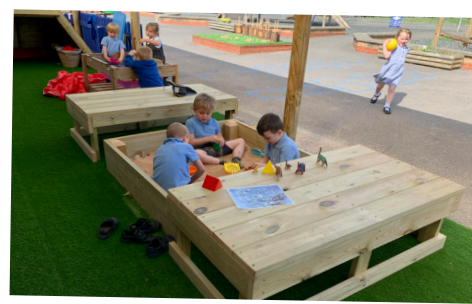
Covered Sand Box- Small