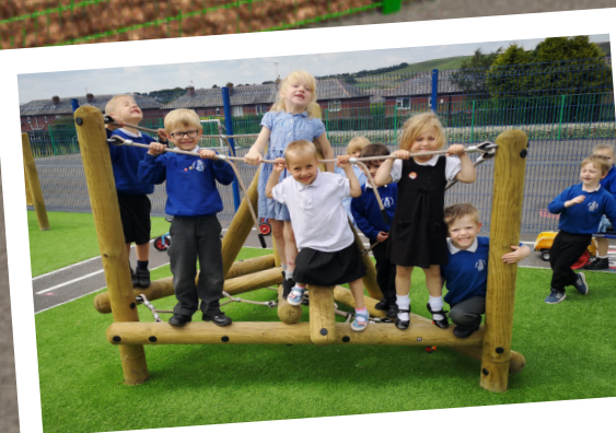
Pinnacle Hill Climber